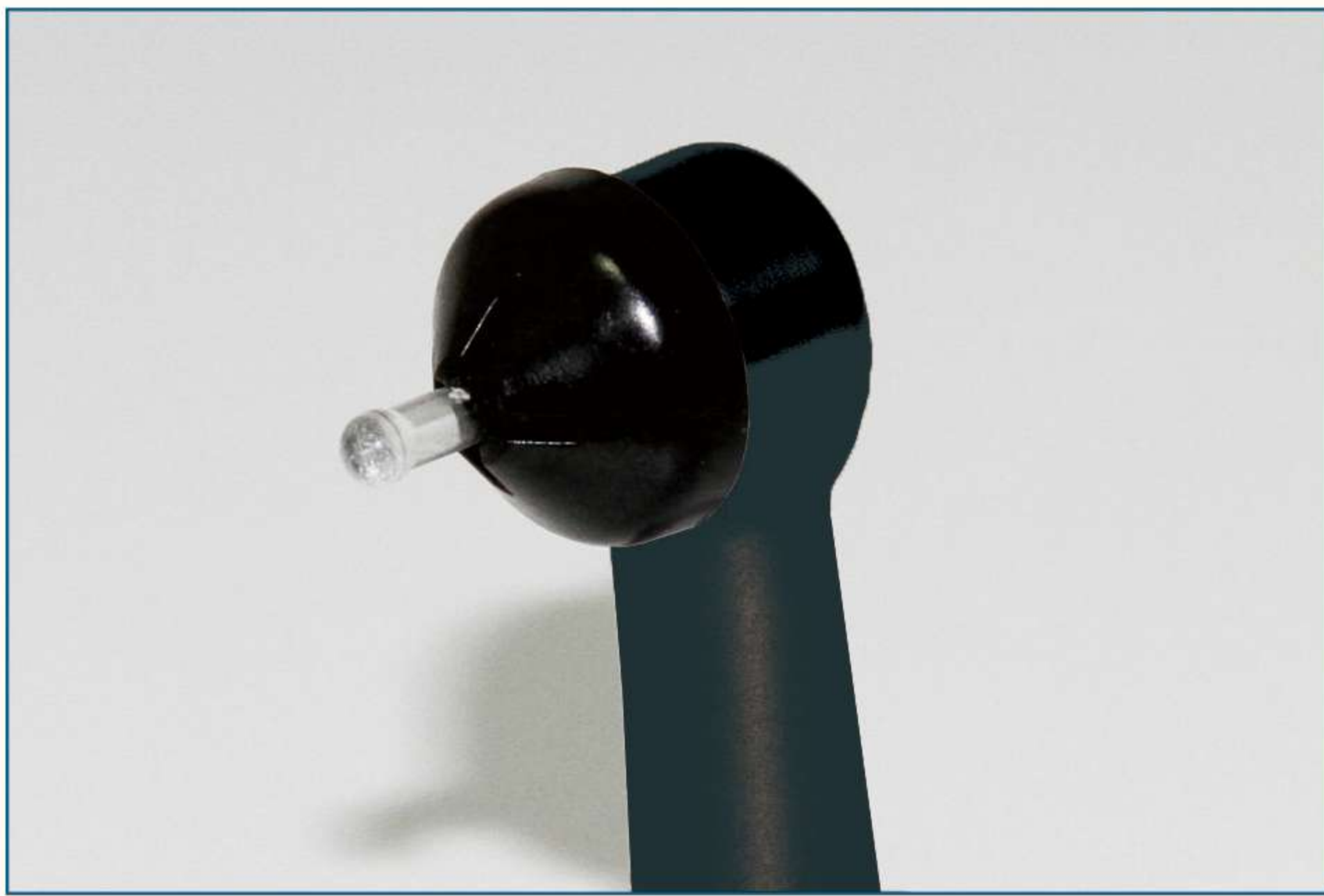
Spherical Curing Lens For small composites and is helpful for building convex proximal contacts