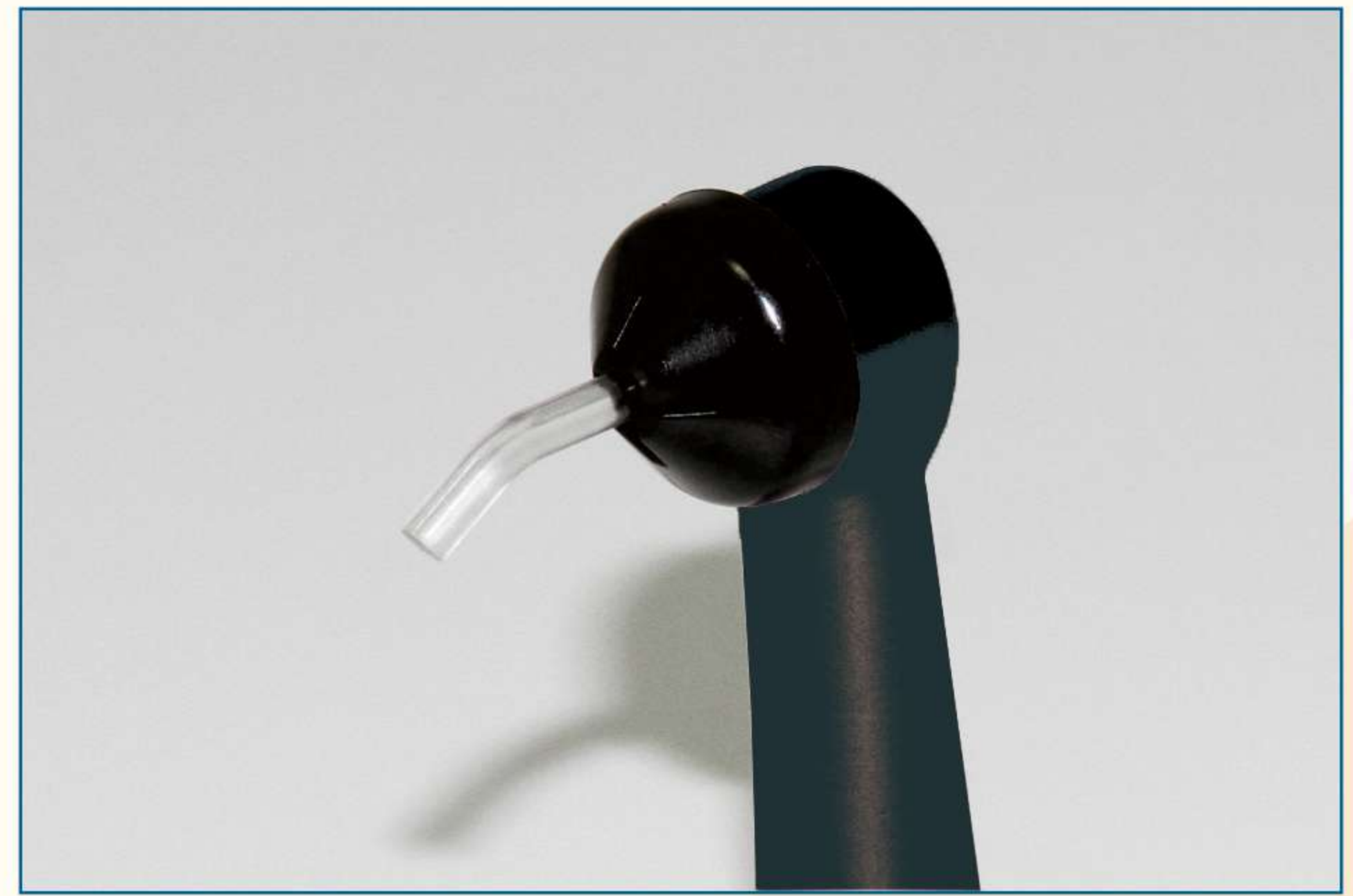
Endo Guide Lens For the preparation of root apex and other stenosis.